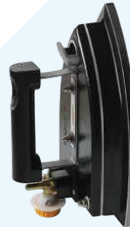
Steel Base Plate