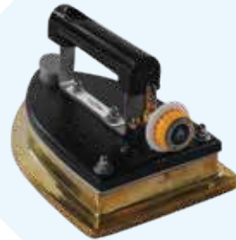
Brass Base Plate